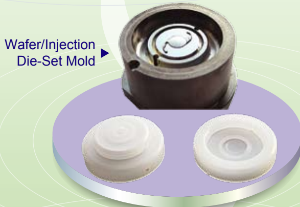
▶ Wafer/Injection Die-Set Mold