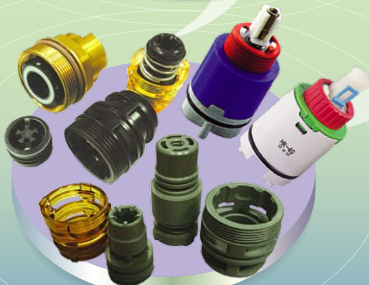
▲ Drinking Water System Accessories & Bathroom Accessories